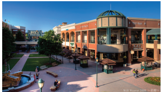
Above: Short Pump Town Center, Henrico County.

Since that time, nearly 30 CDAs have been authorized, and Virginia’s local governments have been increasingly receptive to CDAs as a way to harness private tax dollars to solve key economic development and infrastructure challenges.