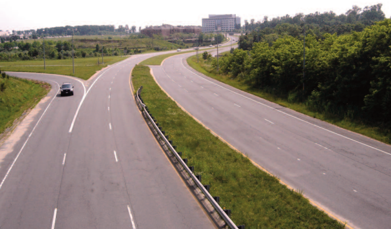
Above: CDAs assist with the procurement of alternative financing for infrastructure associated with large developments.

Given that CDAs remain a relatively new financing mechanism, and considering that most jurisdictions have yet to enact policies governing their creation, planners may have questions about the process of creating a CDA, how to navigate between key players, or even understanding basic terminology. This article briefly explores CDAs, including an overview of their history, process, and use across the Commonwealth.