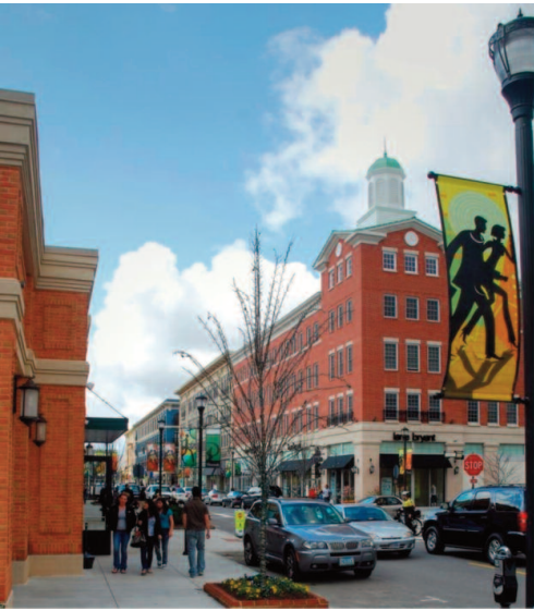
Peninsula Town Center, Hampton Roads.

By Joseph L. Curtis, Jr., AICP Hampton Roads Section