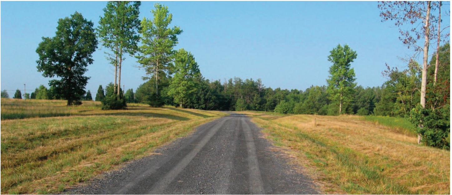
Rural access to private subdivision, Fluvanna County.