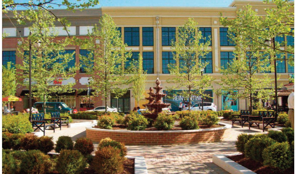
Peninsula Town Center, Hampton, VA.

Deadline for winter issue is December 3, 2010.