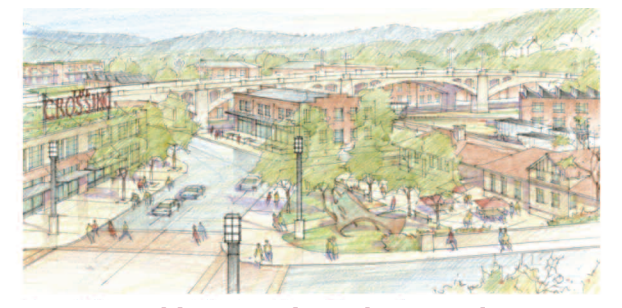
Looking east into the Crossings

To revitalize Focus Area #2 - The Crossings, buildings of significant character and history were retained to preserve the industrial history of the area and add character to this new urban district. Such buildings could provide cheap space for artists and startups. The urban form was then restructured with a main street and central piazza lined with new buildings of an industrial flavour. The district is energized by the greenway crossing through its center.