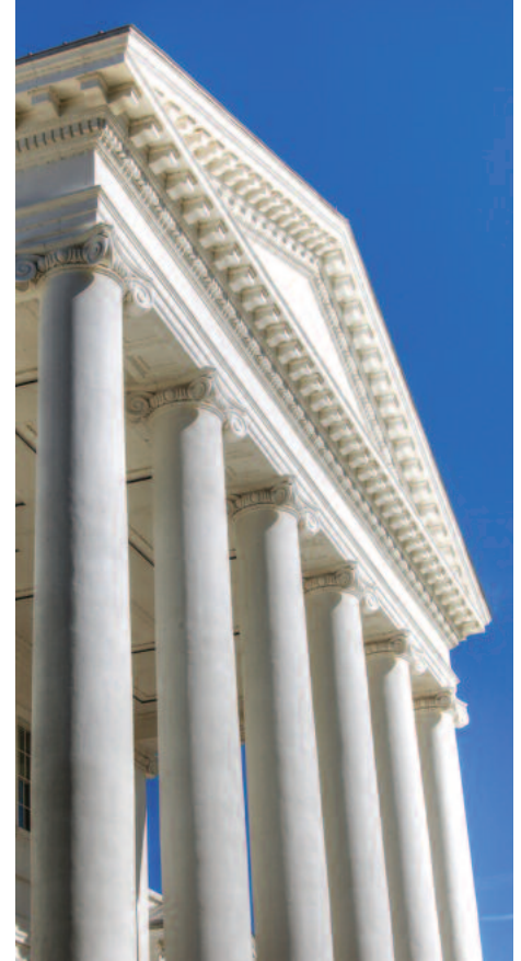
Above: Virginia Capitol Building.

Humpback Rocks.