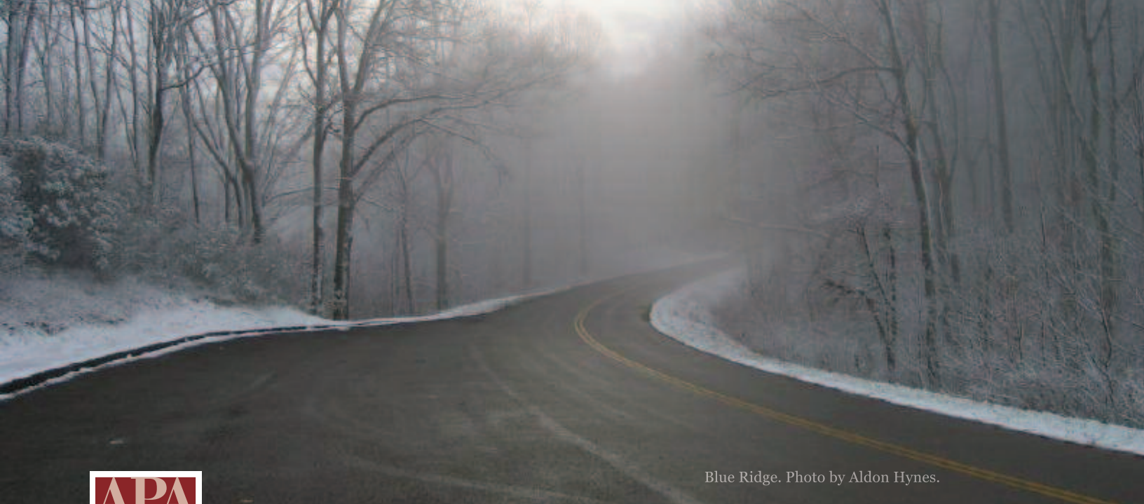
Blue Ridge.