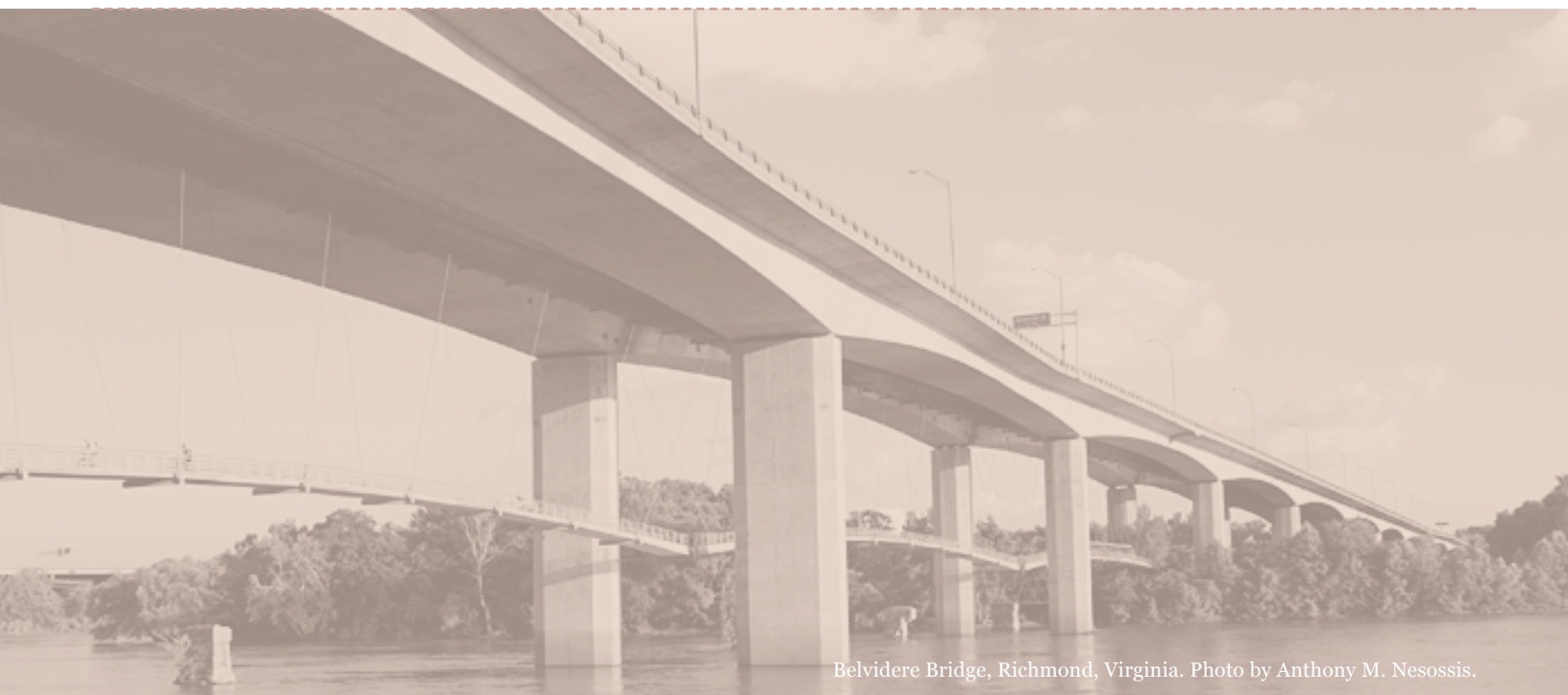
Belvidere Bridge, Richmond, Virginia.