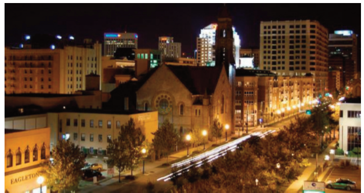
Norfolk skyline.

Another issue that I find interesting is the relationship between mid-decade Census estimates and the 2010 Census. As yearly Census estimates came in over the past decade, commentators battled over their meaning. Does it matter if a Census estimate in year X shows more big cities growing? Or does it matter more if the trend appears to be reversed in year Y?