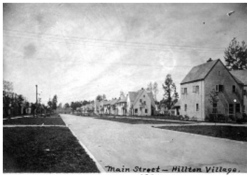
Above: Hilton Village

The Northern Virginia Section is attempting to reach more people by updating its membership records. A uniform email address is used to disseminate information to section members and an updated list of contact information for those interested in participating is the Section's next goal. All those interested in receiving information regarding Northern Virginia Section activities are asked to contact Hillary Zahm at vapanova@gmail.com .